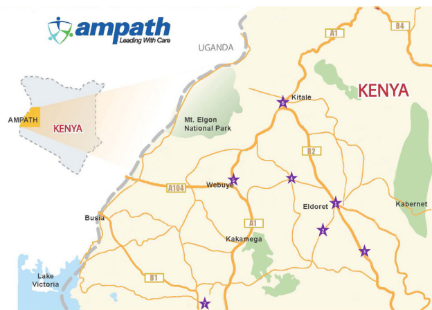
Figure 1 Clinical sites included in this study. Clinical sites from which healthcare workers (HCWs) were enrolled in this study (starred). (1) Moi Teaching and Referral Hospital (MTRH): Clinic modules 2–4, Rafiki Center of Excellence in Adolescent Health; (2) Mosoriot Rural Health Training Center; (3) Burnt Forest Sub-District Hospital; (4) Turbo Health Center; (5) Webuye District Hospital; (6) Kitale District Hospital; (7) Chulaimbo Sub-District Hospital.

Given that adolescents have developmentally specific challenges and require adolescent-friendly health services to meet their needs, it is critical to examine the specific impacts of the pandemic on HIV services and engagement for this group, as well as the HCW-level and clinic-level efforts to mitigate them. In this study, we examined the impacts of the COVID-19 pandemic on adolescent HIV service delivery and care engagement in western Kenya. We used in-depth qualitative inquiry with HCW regarding clinic-level and system-level changes, as well as broader economic and social impacts of the pandemic, to examine these intersecting challenges and the ways in which HCW endeavoured to sustain adolescent HIV care during this time.