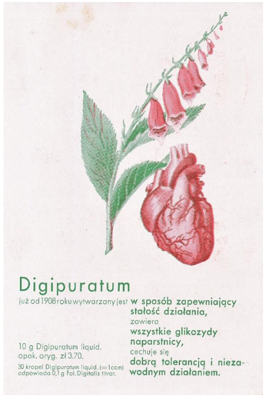
Figure 1. The front of the card depicting foxglove and the human heart. Text advertises for digitalis a medication derived from foxglove and used to treat congestive heart failure.