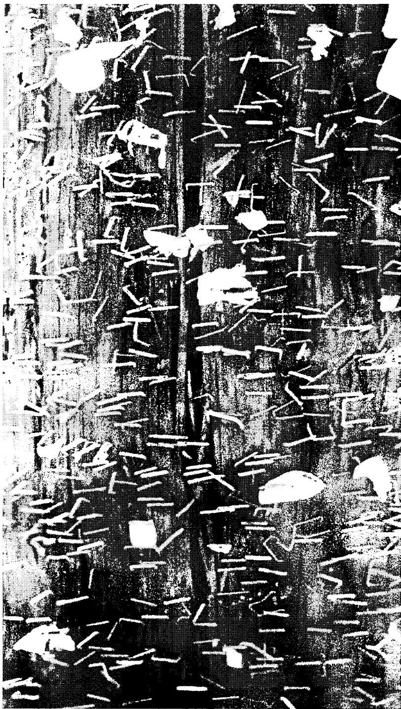
Utility Pole Brad Whetstine