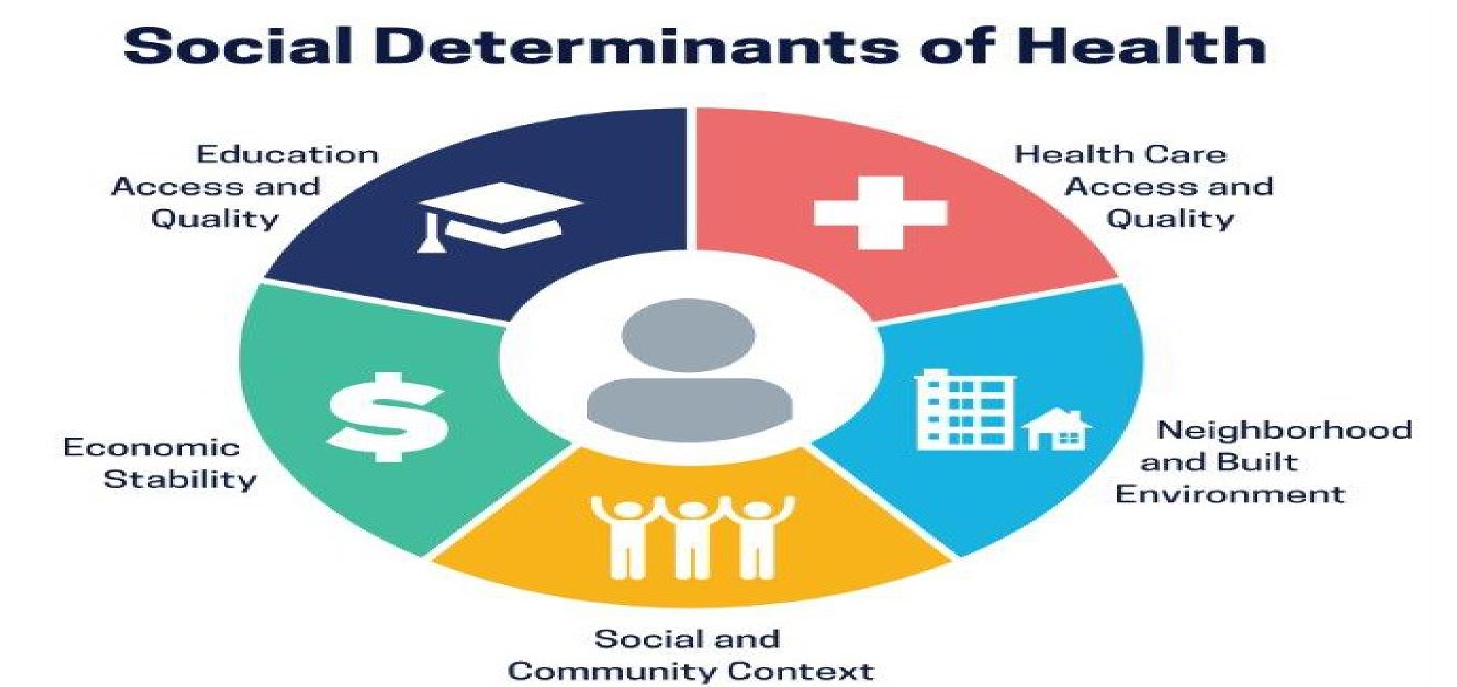
Figure 2.(Healthy People, 2030) Five domains of Social Determinants of Health

Every individual must interact with their environment to function fully, optimally and meet their needs. However, the conditions in which people live their lives can be directly proportional to their health outcomes. SDOH is summarized in the picture below.