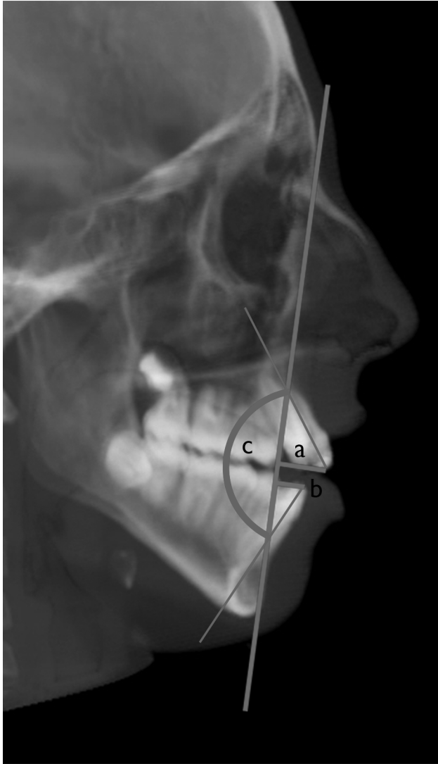
Figure 1. CBCT showing measures for (a) overjet, (b) overbite, and (c) interincisor inclination.

a laptop computer. Articulation evaluated different tongue movements, ie, single tongue, double tongue, triple tongue, and flutter tongue, using four exercises (A, B, C, and D). Range was measured by determining the maximum number of semitones over the note C5 that could be reached. Endurance was determined by timing the maximum continuous play while keeping the notes above a specific sound level. Sound level was controlled using a decibel meter (RadioShack Sound Level Meter: Radio Shack Corporation; Fort Worth, Tex) placed 19 inches from the bell of the trumpet. A few students could not perform all tests, resulting in lower numbers for some tests. An experienced music teacher-investigator evaluated all performances.