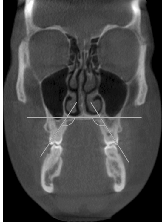
Figure 2. CBCT showing measures for molar inclinations.

A three-dimensional cone-beam computerized tomography scan (3D CBCT) was taken of each student the same day as the skills test. Since the 3D CBCT was available for another part of the study and the CBCT also