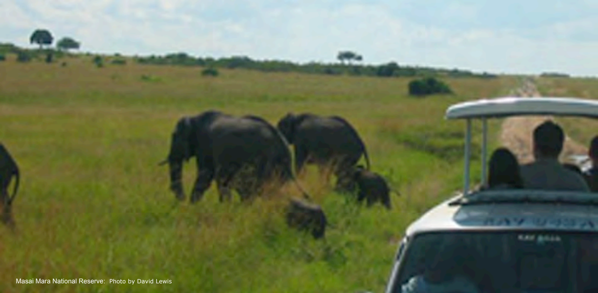
Masai Mara National Reserve

unwanted textbooks and library discards in support of non-profit literacy programs such as Books For Africa.