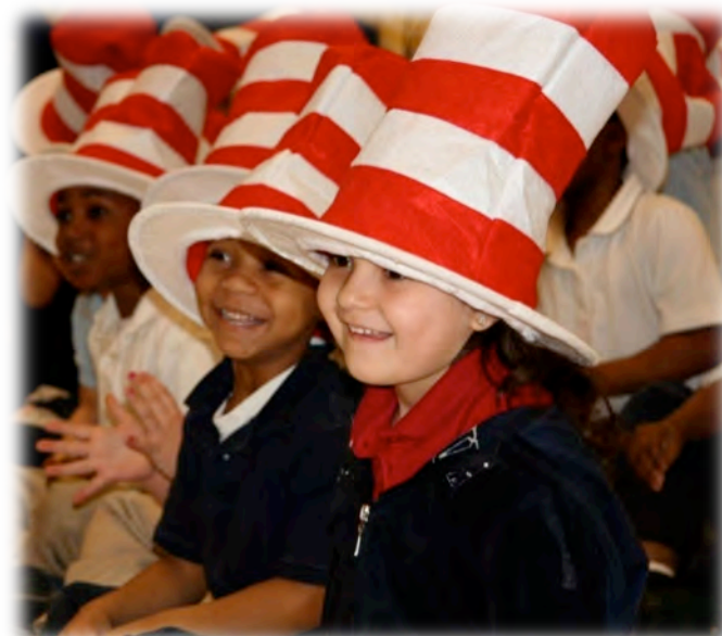
IPS School 63 K-2 grade students attending Dr. Seuss Day celebration.