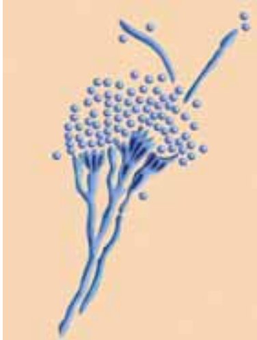
Penicillin Mold Fungus

A fungus is actually a primitive plant. Fungi can be found in air, in soil, on plants, and in water. Thousands, perhaps millions, of different types of fungi exist on Earth. The most familiar ones to us are mushrooms, yeast, mold, and mildew. Some live in the human body, usually without causing illness. Fungal diseases are called mycoses.