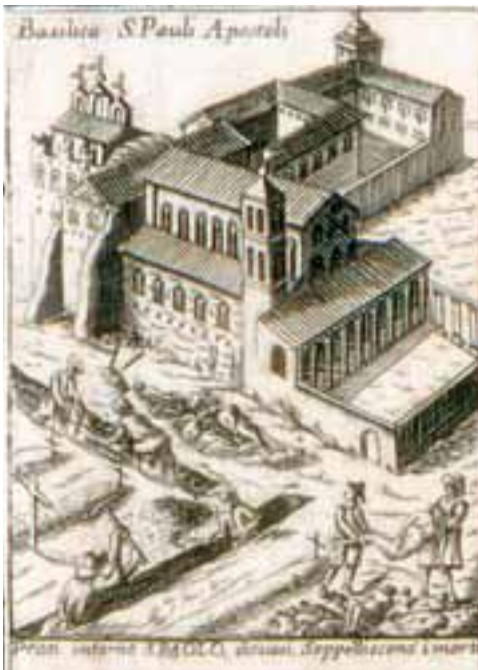
Black Death Plagued Medieval Europe

Smallpox, which is caused by a variola virus, was described in ancient Egyptian and Chinese writings. According to some researchers, over the centuries smallpox was responsible for more