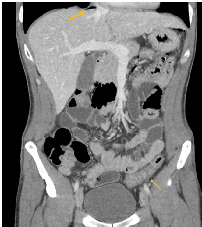
Figure 1. A coronal image from the computed tomography scan of the abdomen and pelvis performed on initial admission showing free air (top arrow) and thickened rectosigmoid (bottom arrow).

A 39-year-old male veteran presented with 2 weeks of progressively worsening lower abdominal pain. He denied having fever or diarrhea before admission. On initial evaluation, his vital signs were normal. He was tender to palpation over the left lower quadrant and suprapubic areas but without any peritoneal signs. Laboratory test results were remarkable for a white blood cell count of 15,200/mm 3 , hemoglobin of 17 g/dL, and C-reactive protein of 13.5 mg/L. Fecal calprotectin level was elevated at 278 µg/g. A contrast-enhanced computed tomography (CT) scan revealed a diffusely edematous rectosigmoid colon and rectum and