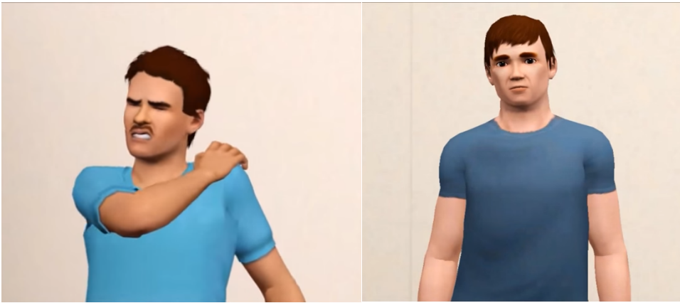
Figure 1. Example of virtual humans

Right image displays a Hispanic patient displaying severe pain. The left image displays a non-Hispanic White patient displaying mild pain.