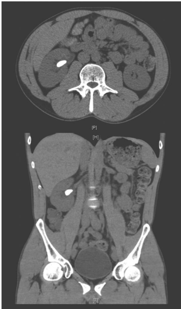
FIG. 1. Preoperative CT abdomen/pelvis (renal stone protocol).

CT abdomen/pelvis without contrast (renal calculus protocol) was done and demonstrated a 2 cm nonobstructing stone in the right renal pelvis (Fig. 1). The average Hounsfield unit value was noted to be 825. The patient was scheduled to undergo right percutaneous nephrolithotomy (PCNL) within 2 weeks of presentation.