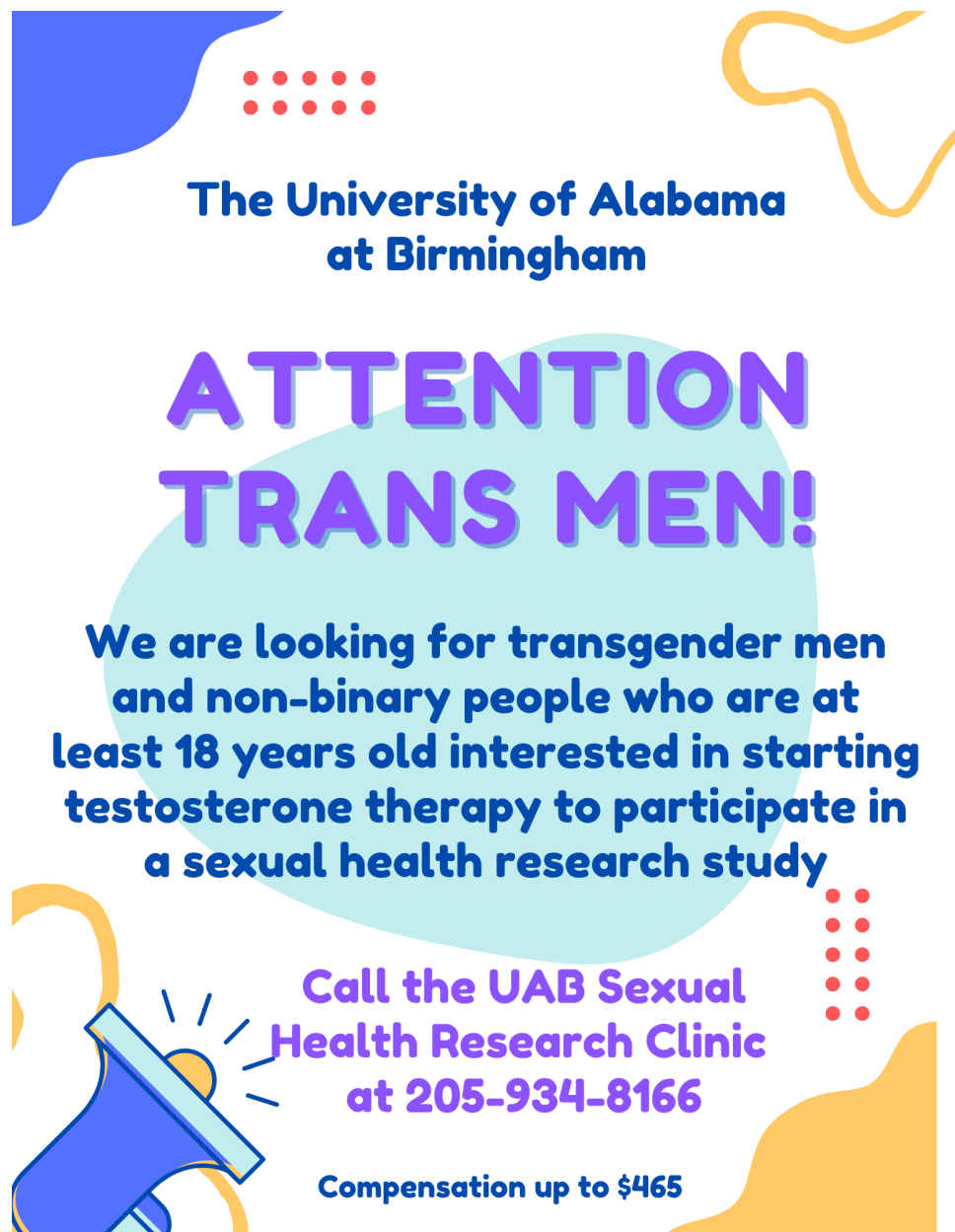
Figure 1 Study recruitment flyer. UAB, University of Alabama at Birmingham.

the Birmingham, Alabama, USA metropolitan area, post advertisements on social media channels, and encourage study participation through word of mouth. After contacting study staff and/or being approached by a provider about study participation, interested individuals will be instructed to arrange a study screening visit at the UAB Sexual Health Research Clinic (SHRC). These recruitment methods were vetted through stakeholders in the local transgender community prior to implementation and will be adapted throughout the study period to optimise community engagement.