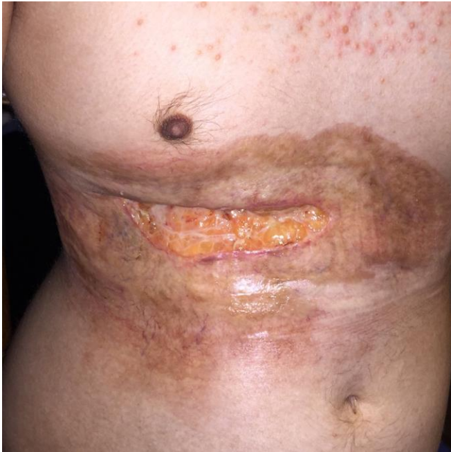
Figure 4: Improvement of the ulceration after treatment with topical, intralesional, and systemic corticosteroids, as well as doxycycline.

and low dose prednisone are characteristics of early superficial granulomatous PG [3, 4].