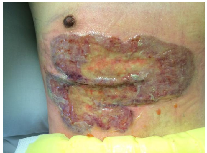
Figure 1: Ulcerated plaque on the right lateral chest with violaceous, undermined borders, and a yellow fibrinous base after right rib cartilage graft harvest.

A 26-year-old man with a history of congenital bilateral microtia, unilateral renal agenesis, left aural atresia, and right external auditory canal occlusion was admitted for rib cartilage graft harvest and left ear re-construction. A week after the surgery, examination of the rib harvest site on the right lateral chest revealed a 10×19 centimeter, ulcerated plaque