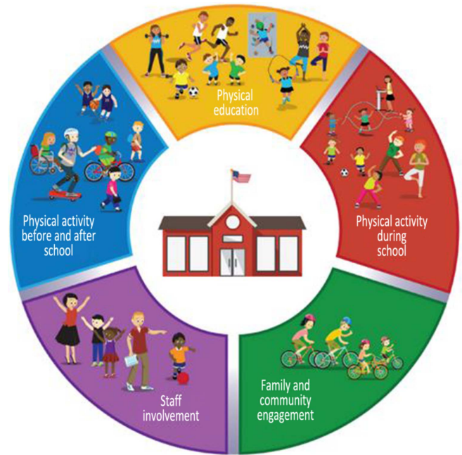
Figure 1 — Comprehensive school physical activity program framework (CDC, 2019).

CSPAPs have gained significant traction across the globe in research and professional recommendations related to youth physical activity promotion (Carson & Webster, 2020). Yet, the evidence base for CSPAPs is still young, and existing CSPAP research is mostly devoted to investigating the effectiveness of individual CSPAP components in increasing youth physical activity engagement (Goal c). Even though physical education is conceptualized as the cornerstone of a CSPAP (CDC, 2019; SHAPE America, 2015), little CSPAP research has investigated how a CSPAP or its various components can be used to help physical education meet national