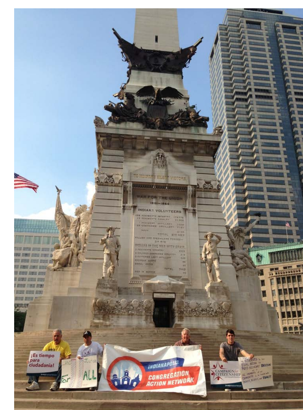
Prayer vigils were conducted extensively throughout the summer of 2013 in order to sway public opinion and Indiana's politicians to support the immigration reform. These occurred at the Soldiers and Sailors Monument in Indianapolis multiple times a week throughout May and June 2013. Attendance ranged from four people to over 30 at these prayer vigils.