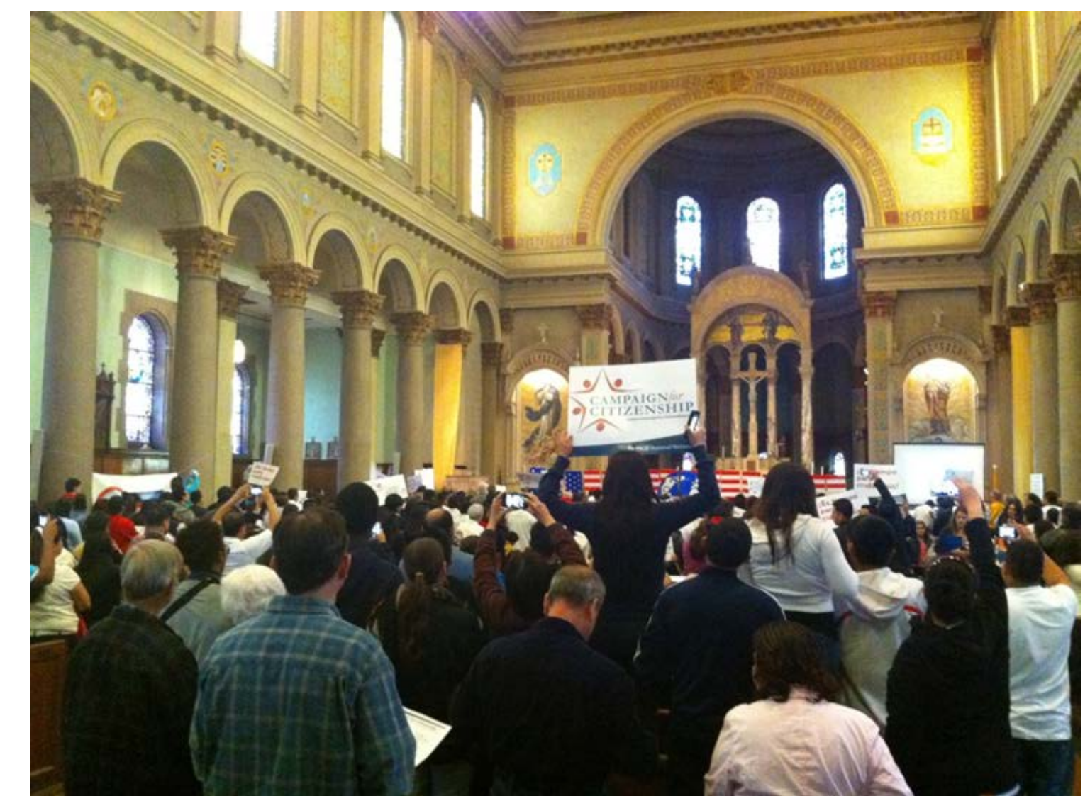
Prayer vigils ranged in size, this one occurred at a local Indianapolis parish and had approximately 800 people in attendance. Congressman André Carson pledged his public support of immigration reform at this event.