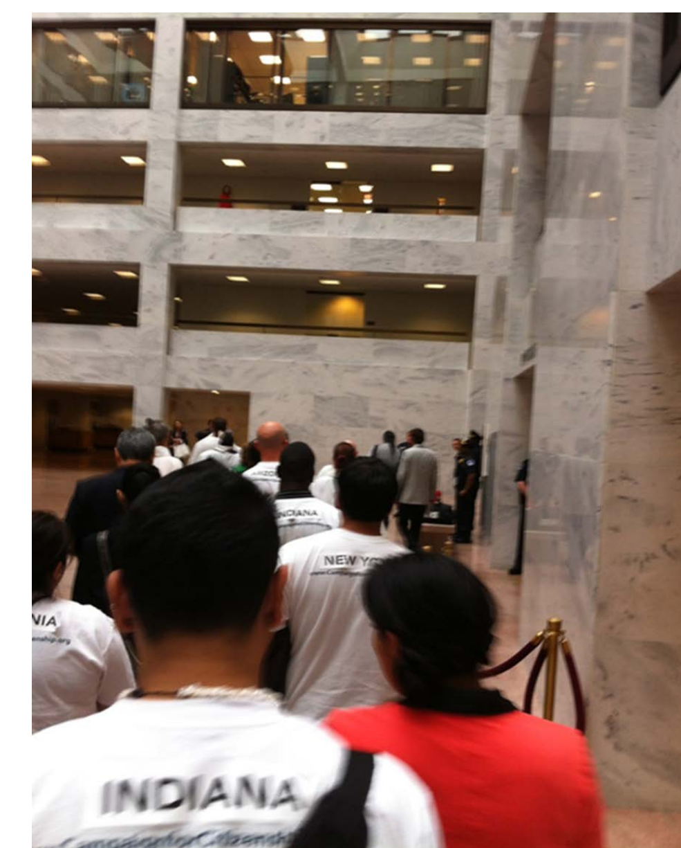
This is a silent march in the Hart Senate Building, Washington, D.C. which occurred in May 2013 for immigration reform. Members of IndyCAN met with other members of the People Improving Communities through Organizing (PICO) to lobby politicians for immigration reform. This line was made up of approximately 60 people lead by six robed clergy people.