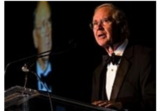
Gil Grosvenor speaking at the Grosvenor Gala in 2006.

Grosvenor joined the Society staff in 1954 as a photo editor, after graduating from Yale University. He was editor of the magazine from 1970 to 1980, before