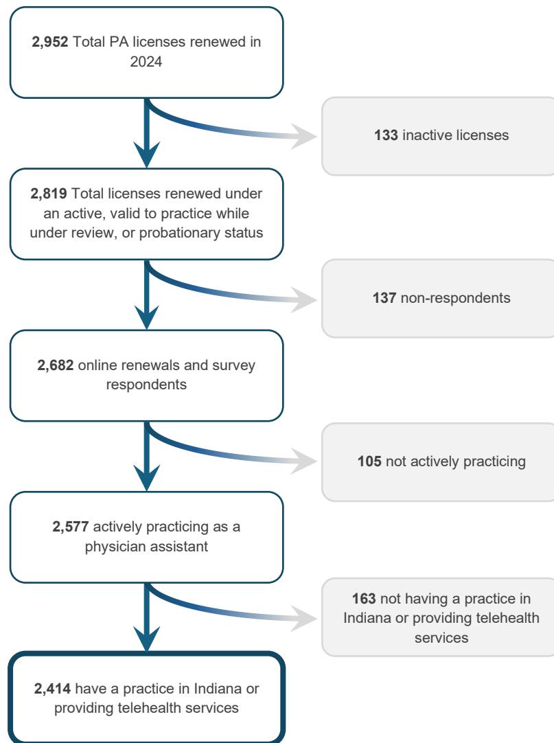
Figure 2.1 Selection criteria for physician assistants actively practicing in Indiana.

Of the 2,952 PAs who renewed their license in 2024, 133 had inactive license and were excluded from our final report sample. A further 137 were removed because they were not found to have any survey responses. Another 105 were taken out of the sample due to not actively practicing. Finally, an additional 163 were not included in the final report sample because they indicated they did not practice in Indiana. This left a final report sample size of 2,414 PAs who filed their renewal online and are actively practicing in Indiana, either in person or via telehealth. More information is available in Figure 2.1