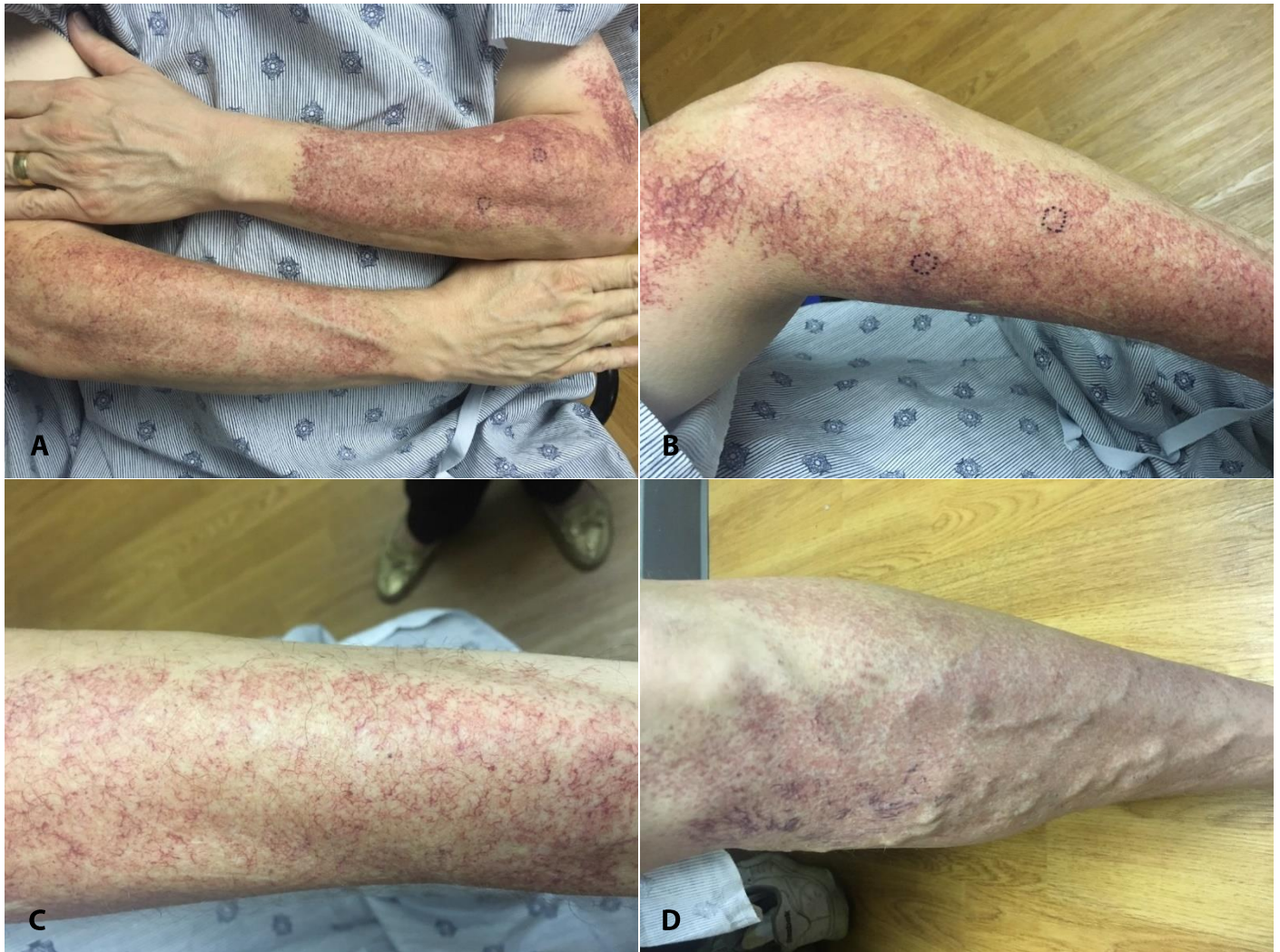
Figure 1: Clinical presentation of cutaneous collagenous vasculopathy with macular telangiectasia on the arms (A, B, C) and lower leg (D).

disease, neurologic disorders, bleeding disorders, or cancer.